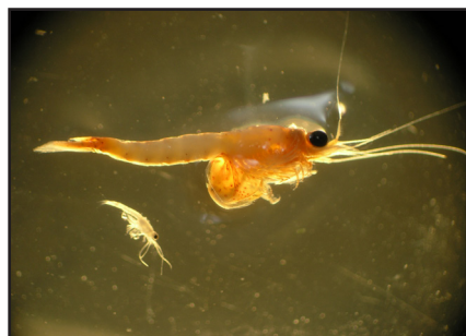
Hemimysis anomala , a new invasive mysid in the Great Lakes.

A new invasive species in Lake Erie and other Great Lakes that is also making its way into the Finger Lakes region, H. anomala is the first mysid to become established in Lake Erie. H. anomala 's