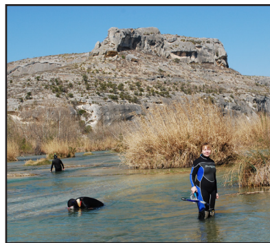
Surveying P. popeii in Devils River, Texas, March 2011