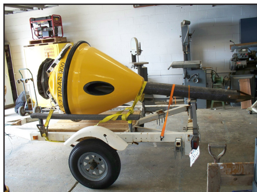
GLOS buoy in preparation for deployment.