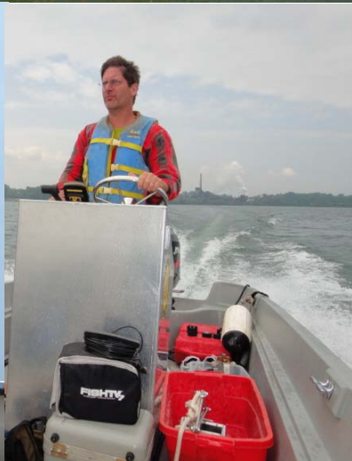
The Lake Erie Nearshore and Offshore Nutrient Study (LENONS) June 2011