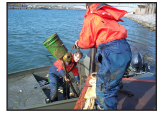
The new Polar-kraft boat

We have purchased a 20' Polar-kraft that can be used in both rivers and the lakes. We completed engine break-in and looked into setting it up as an electro-fishing boat. Two Boston whalers were upgraded. One had its hull refinished and painted and had a console installed. The other received a new engine, bench, and steering. The old electro-fishing boat was rewired and refurbished so it could be used this spring. Although it hasn't arrived yet, we commissioned a new Privateer. This 28' boat is mostly just open deck with a console and a t-top. It will be a good platform for lake work, while still being small enough to transport by trailer to remote locations.