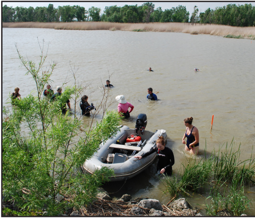
Joint unionid survey by seven research teams from Michigan, New York, Ohio, and Pennsylvania in the Ottawa National Wildlife Refuge (Ohio) in June 2011.

diversity. Fifteen rare freshwater mussel species were recently added to the state's list of threatened species, and 11 of those are currently under consideration for federal listing by the U. S. Fish and Wildlife Service.