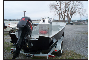
Upgraded Boston whaler