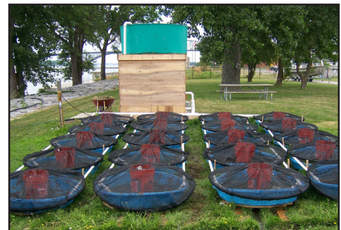
Stream Mesocosms for round goby experiments Great Lakes center

This project examines the role of exotic invertebrates in Lake Erie benthos that increased dramatically during the last decades. Our 2009 and 2011 benthic survey of Lake Erie has shown that benthic invaders currently constitute 40% of total benthic density, and over 95% of the total wet biomass. Benthic community structure and dominance has changed significantly since 1979, and the community is currently dominated by exotic species, resulting in dramatic changes in the food web dynamics of the whole lake.