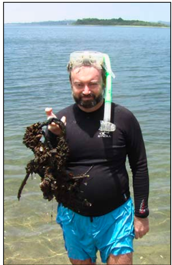
Invasive bivalve Limnoperna fortunei in Rio Tercero Reservoir, Argentina