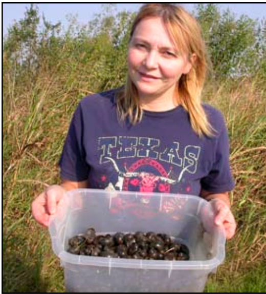
Applesnails Pomacea insularum collected on a rice field in Texas – Lyubov Burlakova