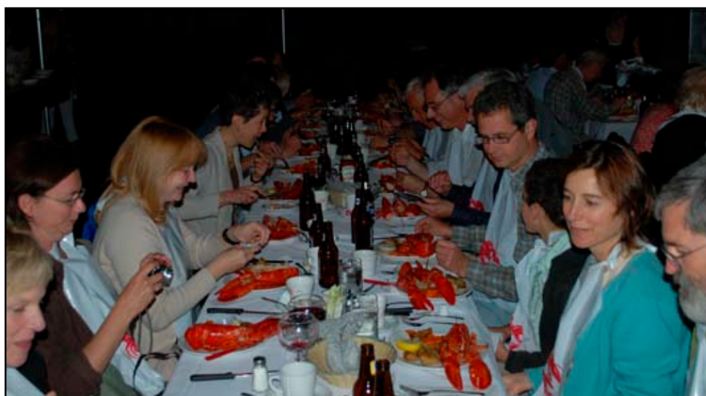
Lobster dinner during the ASLO Conference, 2008