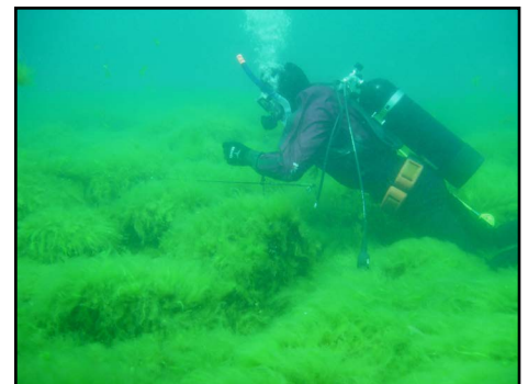
Diver over a dense Cladophora bed.

Cladophora is a green alga that grows attached to hard substrate surfaces in many aquatic habitats throughout the region, growing over a meter in length under optimal conditions. In the recent decade, this alga has resurged as a nuisance along the shorelines of the lower Great Lakes. As part of the 2018 CSMI year in Lake Ontario, US EPA divers collected benthic algal samples to begin an assessment of biomass and coverage over the summer growing season. They documented the highest south shoreline biomass in areas near Olcott, NY. As a follow-up to the 2018 assessment, Dr. Chris Pennuto, GLC research scientist and professor of Biology, was awarded a $103,000 grant from the USGS to document water quality conditions in and near Cladophora beds throughout the growing season. The resulting data will be shared with GIS and satellite spectral imaging experts to refine models predicting Cladophora biomass from satellites. Joining Dr. Pennuto on the project are James (Jay) Wagner, Biology graduate student, Kyle Glenn, Biology undergraduate, and two yet to be named students. It will be a busy summer on the lake. •