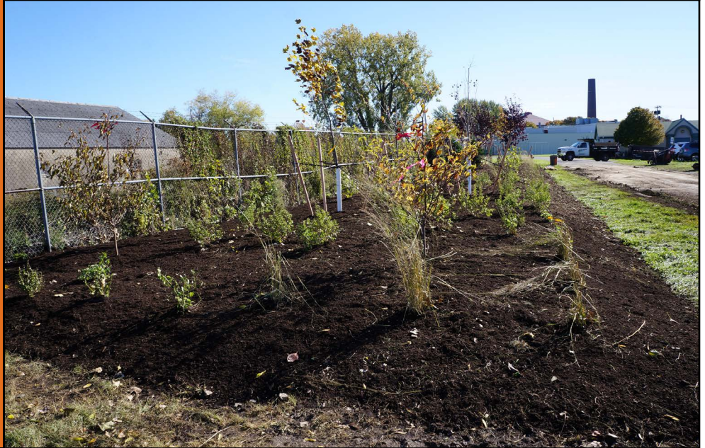
One of the new habitat plantings at the Field Station.