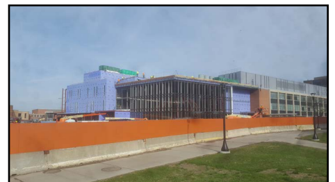
The south side of SAMC Phase 4.

Construction on the final phase of the Science and Mathematics Complex is going along on schedule. Last summer, construction began on Phase 4 and over the fall we watched as building took shape. The two parts of the building were tied together over spring break and soon the outer part of the building will be complete. Then the construction will move inside to complete the interior, and landscaping will be the final touch. Completion is projected for Fall/Winter 2020. One of the neatest parts of construction so far was the construction