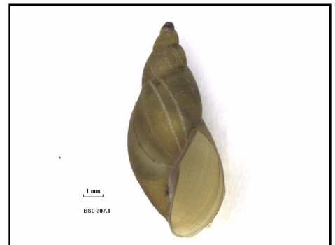
Flat-whorled Pondsnaail.

More information about this project can be found in “Building a DNA barcode reference library” in GLC Newsletter Fall 2017 (PDF, 4MB) . •