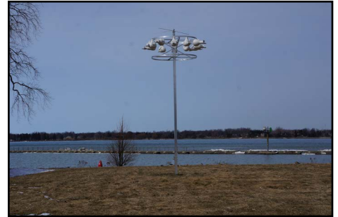
The purple martin houses are situated on the lawn between the teaching pavilion and a habitat planting.