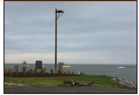
The osprey pole is situated near the waterfront, with another habitat planting at its base.

These habitat enhancements are not only beneficial for the wildlife, but they also offer unique opportunities for ecological education within the city limits. In addition, the public can easily view these features from the Bird Island Pier, which runs parallel to the Field Station and is separated by the Black Rock Canal. If you are looking for something to do this spring, take a walk on the Bird Island Pier and check out the new additions to the Great Lakes Center Field Station. •