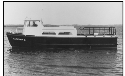
In the 1980s, U.S. Army Corps of Engineers loaned us the R/V Markham III , a 37' tender.