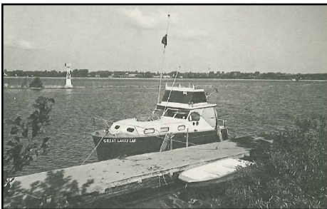
Our first boat, the 34' Great Lakes Cruiser , in service from 1967-1970.

Over the years, we've had many boats in a variety of sizes. Here are some of the most memorable and iconic boats in our fleet.