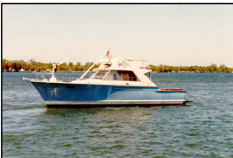
R/V Hutchinson , a 42' Chris Craft Commander, operated from the late 1980s through the 1990s.