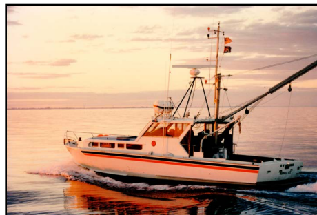
From 1996 through the early 2000s, our flagship was the R/V Aquarius , a 40' steel-hulled vessel.