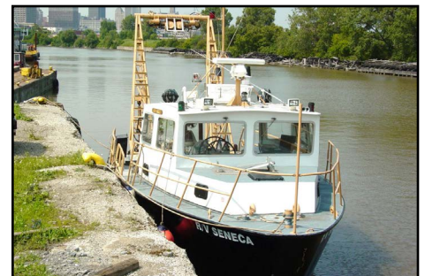
The R/V Seneca took the place of the Aquarius . The 46' former U.S. Coast Guard buoy tender was used heavily from 2001-2010.