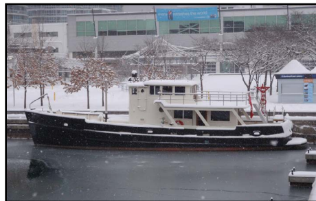
The R/V C.A. Dambach, a 65' T-boat operated by the GLL from 1970-1982.