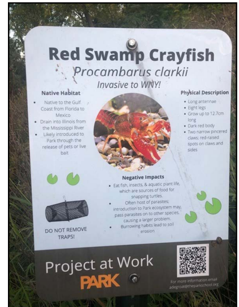
A sign informing visitors of the presence of red swamp crayfish at the Park School.

The increased trapping effort has resulted in an unexpected positive outcome in the Park School ecosystem – the finding of native species! While only a few native crayfish have been found so far, this is a win for researchers as these are the first native species to be seen in the pond since the first red swamp crayfish was spotted in 2020. To date, two native species have been collected at the site. These species include the white river crayfish ( Procambarus acutus ) and the calico crayfish ( Faxonius immunis ). Since hundreds of red swamp crayfish were removed from the pond, this could open some room for native species to work their way back into the ecosystem. With intense trapping still happening, there is hope that more native crayfish will start showing up at the Park School. •