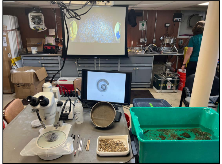
Demonstration set up for the tours in Detroit, including example samples, equipment, pictures, and videos.

In total, GLC scientists were able to collect samples from 56 stations throughout all five Great Lakes. Due to truly astounding teamwork, we are already nearly finished sorting the samples collected during this survey! Although sorting out our targeted organisms is the first step, it often takes the most time. We expect to be finished with all the samples by the end of October. The team enjoyed beautiful sunsets, sunrises, and prepared meals, but most of all they enjoyed being out on the water. •