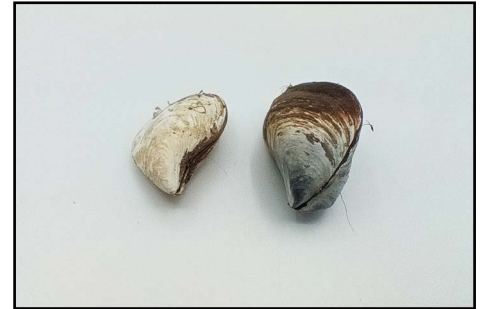
Deep-water quagga mussel vs. shallow-water quagga mussel.