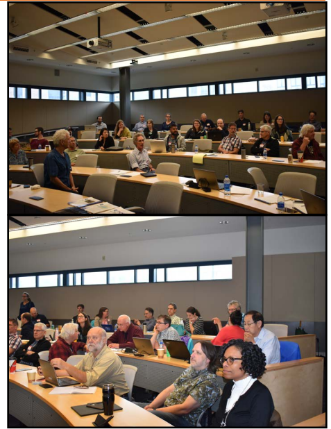
Workshop participants reporting and discussing their 2018 CSMI field year accomplishments.

The International Joint Commission granted $20,000 to the Great Lakes Center to organize and lead a data synthesis meeting. The objectives of this workshop were to report on accomplishments from the 2018 CSMI monitoring year, facilitate information and data sharing among the participating groups, develop collaborations for analysis and reporting around habitat and functional areas, and organize and preserve the data for future use. In preparation for the workshop, participants were asked to identify the most important topics for discussion during the workshop. The organizing team received 22 suggestions which were condensed into four major topics and discussed in breakout sessions during the first day of the meeting: water quality, contaminants, and modeling; open water food webs; benthic food webs; and wetlands and connecting channels.