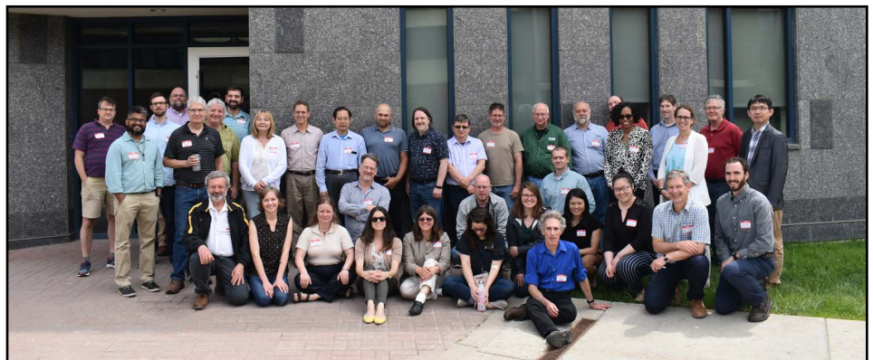
Participants of the 2018 CSMI Ontario Data Synthesis Workshop at SUNY Buffalo State.

The GLC hosted a two-day workshop on June 19-20, 2019, bringing together 49 scientists from 15 agencies and academic institutions from the U.S. and Canada to report on the findings from the CSMI 2018 Lake Ontario survey . The Cooperative Science and Monitoring Initiative (CSMI) helps to address water quality and natural resource management questions by focusing binational monitoring resources on each of the Great Lakes in a five-year rotating cycle.