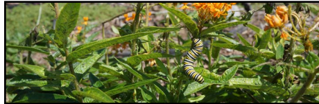
Monarch butterfly larva on butterfly weed.