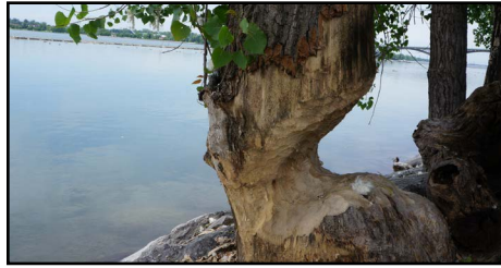
Beaver-damaged cottonwood tree.

As we move into fall, some of our plants are producing fruits and berries. Soon, migrators will move through the region and hopefully find a little haven here. Sources: Lady Bird Johnson Wildflower Center •