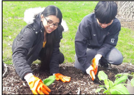
Students planting black-eyed Susans.

Great Lakes Center Buffalo State College 1300 Elmwood Avenue SAMC 319 Buffalo, NY 14222 Phone: (716) 878-4329 greatlakes@buffalostate.edu