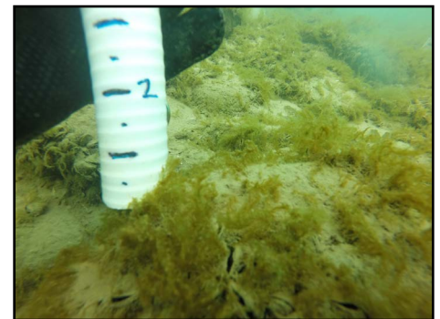
Close-up of Cladophora attached to mussels early in growing season.