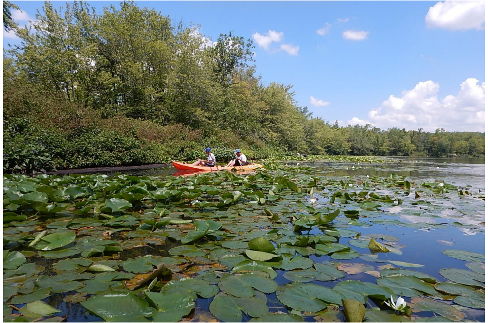
WNY PRISM Crew conducting Chautauqua Lake Outlet Survey, July 2015.