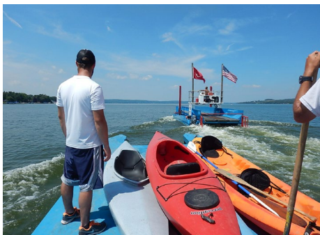
WNY PRISM Crew preparing for Chautauqua Lake Outlet Survey with help from our Partners, July 2015.

We spent the first part of our week looking for both plants in the outlet with help from a few CLA employees, their barge, and some generously donated kayaks. In order to be thorough, we spent some time surveying inlets and creeks in the area such as Goose Creek, Dutch Hollow Creek and Bemus Creek along with a few marinas. We couldn't have asked for better weather, it was in the 80s and sunny all week! If anything, we were thankful for some cloud cover! The good news is we only found about 20 water chestnut rosettes (all found within a mile of each other within the outlet) and no hydrilla. If boaters and other residents continue to be on the lookout for these plants, they won't have a chance to invade beautiful Chautauqua Lake.